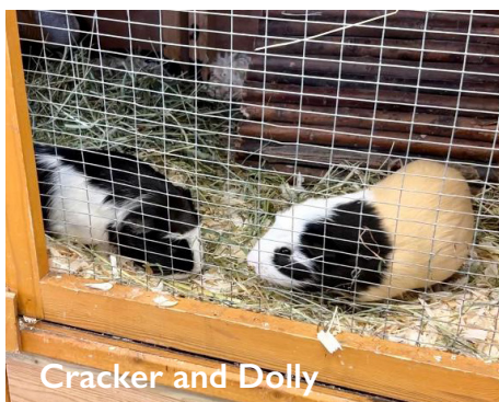
Cracker and Dolly