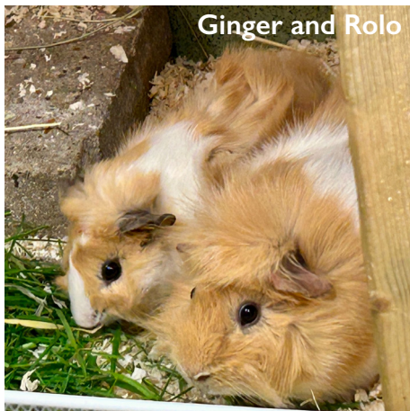
Ginger and Rolo