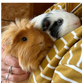
Ant and Dec